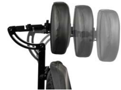
HD-BH - Removable Multi-Axis Headrest Hardware - Depth adj .5" behind backrest to 7" forward