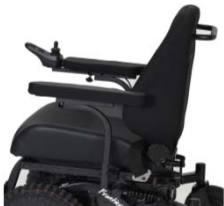
1386/87 - Standard Removable Armrest - attaches to base-height adj 2"