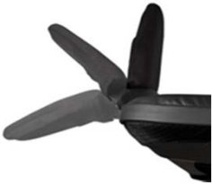
LT1-SA - MPS Seating - Comfort Company Single Swing Away Lateral Hardware