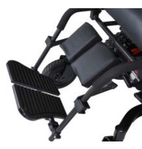
SMCP - Swing Away Side Mount Calf Pads - For 1371 - w/ breathable fabric - 2.5" x 8" x 2.5"