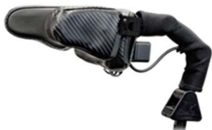
IDH300-1 - Stealth i-Drive Head Array