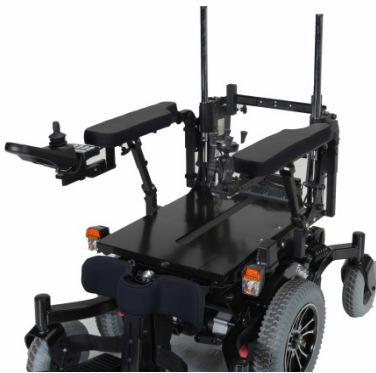
ASKIT - 135° Integrated Sheer Reduction (IRS) Power Recline for Rehab Seating System* 400 lbs. Capacity