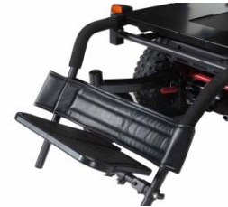
CS - Calf Staps - Side Mount Only - Length 21"-39" Width 4.5"