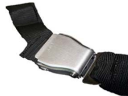
ABSB - Airline Buckle Seat Pos. Strap - 2"x61"