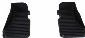
PT-0117 - Extra Large 2 pc Footplate w/ 2" Heal Guard - May Not Fit w/ all Seat Sizes