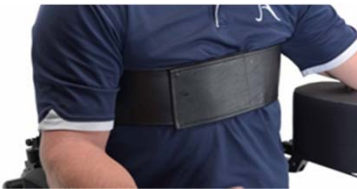
1401 - Loop Style Positioning Chest Strap - 4" x 49.5"