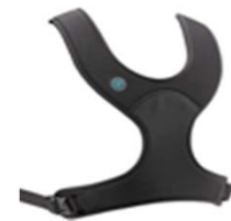
SH331L-B1 - BODYPOINT Stayflex, Butterfly, Narrow Front-Pull L w/o Zipper - 3.5" at Chest