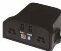
PG-BTM2 - R-net Bluetooth Module 2 - Joystick controls cell phone or computer