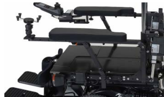
PT0031 - Reclining Flip-Up Armrest - attaches to base & seat back-height adj 4" & Angle Adj 90° - 105°-