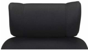
1370 - MPS Cloth Headrest - MPS Seat Back Only - 12x4.5x6.25