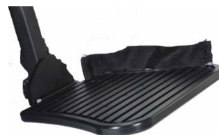
HL - Heel Loops - Pair Length 11.5" - 13" & Width-1"