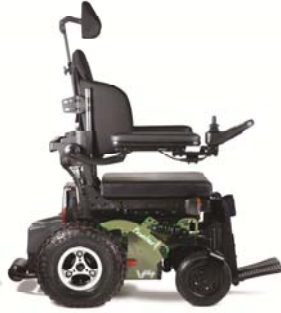
Rear Wheel Drive