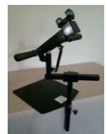
FM200 - Limited Mobility Fishing Mount