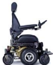
1575C - All Terrain Tire Complete w/ Brushed Aluminum Rim - Drive Tires Only