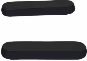
AP3(1377R/L) - 3"x12" Desk Length Oval