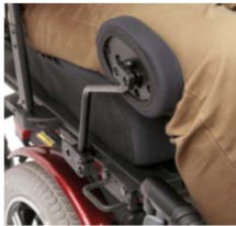
Adductor Cover with Gel Insert - RQ30094