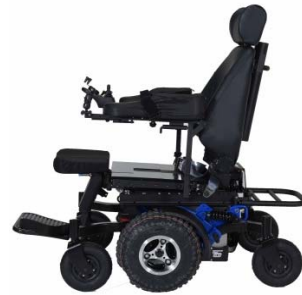
Mid Wheel Drive All Terrain