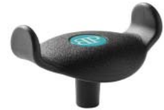
PC102A - BODYPOINT U-Shaped w/ Flex Shaft (3" or 4")