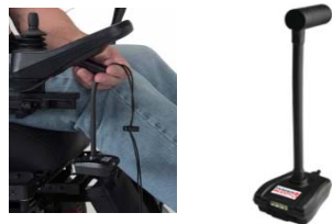
PWB - Power Buddy - Includes USB Charging Port & Reading Light