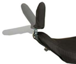
LT1-RGD - Rehab Seating - Comfort Company Single Rigid Lateral Hardware