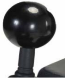
PC103B - Bodypoint Ball Knob - 1/4" ball