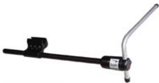
MM - Stealth Midline Mount - 2 position mount for easy swing away - rotation 0° - 180°