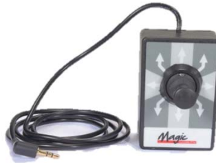
3636JS - 8 Way Toggle - Mounted on the inside or outside of joystick - Controls modes through toggle not through joystick