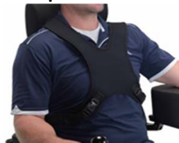
PBH - Padded Butterfly Positioning Chest Strap - 7" at Chest