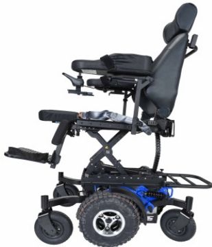
LS - Variable Seat Height with 12" Seat Elevator for Transfer Assist* 340 lbs. Capacity