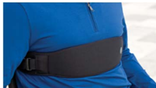
SH103M - Chest Strap BODYPOINT Monoflex, Rear-Pull M - 4" x 49.5"