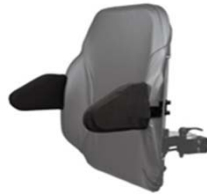
LT1-L/RS4W4T - MPS Seating - Comfort Company Single Lateral Pad