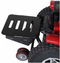
2997(V6) / 2967(X8)- Luggage Rack 10.5" x 13"