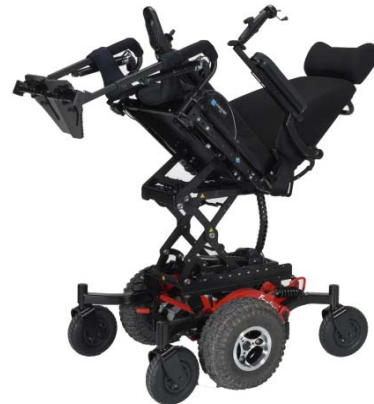
2850 - Variable Seat Height & Tilt Combination* 340 lbs. Capacity