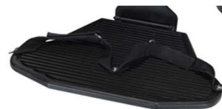
827A - Foot Straps - Pair - size