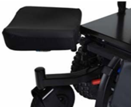
AMP - Swing Away Amputee Support - 10" extension right or left