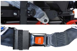
WC19V66 (V6)-WC 19 Transit Kit WC19X86(X8)-WC 19 Transit Kit

Approved According to ANSI/RESNA WC 19 - Includes Lap Belt 600mm 2"x32"