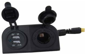
CM - Accessory Charger - 12 Volt/car outlet & USB Port with a max draw of 6 amps