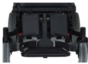
1550 - Fixed Center Mount Calf Pads - 5.5"x6.5"x1.75