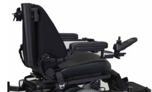
3072/3073 - Cantalever Flip Back Articulating - attaches to seat back-height 4" & angle adj 90° - 75°