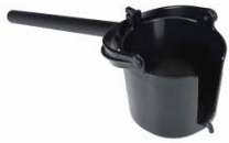
PT0052 - Cup Holder - Self Leveling