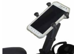
PT0133 - Cell Phone Holder - Adj. to fit most cell phones