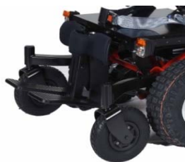
2232PG - Center Mount Power Elevating Articulating