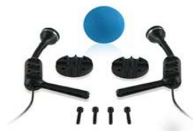
PG-CK - Chin Control - w/ Bib Mount and Adapter