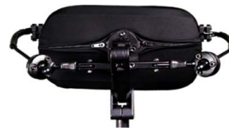
CPS9 - Swing Away Egg Switch Hardware - Stealth