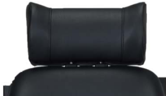
1370V - MPS Vinyl Headrest -MPS Seat Back Only - 12x4.5x6.25