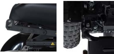
PT0036(V6) / PT0037(X8) - Lift Brackets - Used with 4 Pt Boom Lift