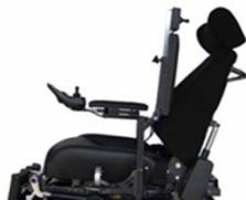
FUA(1388/89) - Flip-Up Armrest - attaches to base-height adj 3" & angle adj 90° - 155°