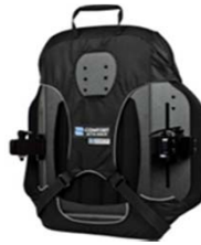
DK-V - Visco Back w/ High Resiliency Foam - Back looks like an ACTA Back