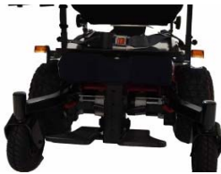
2855(V6) / 2857(X8) - Lighting Kit Mounted on Seat - 2 Headlights, 2 Red Marker Lights w/Turn Signals