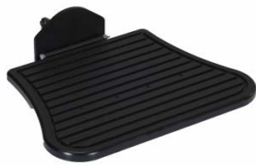
1548 - Center Mount w/1 pc flip-up footplate 10" x 13", 10" height adj