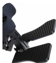
PT-0109 - Extra Large 2 pc Footplate - May Not Fit w/ all Seat Sizes - 5.5"x11.5"