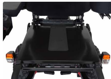
Rehab or Flat Pan- As small as 13" x 13" & as large as 23" x 21"