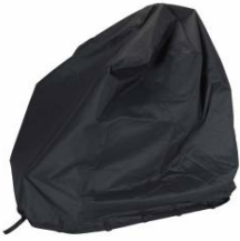
1605 - Waterproof Wheelchair Cover