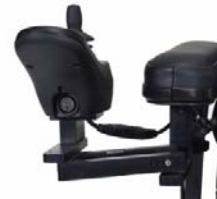
1500P - Swing Away Joystick - Swings over 4.5" to the Right