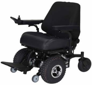
Front Wheel Drive