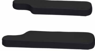
AP4(1378/79) - 4"x16" Tapered Oval