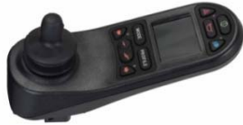
PG-JSM509 - Color LCD Joystick Display - w/MonoJack Ports for External Switches