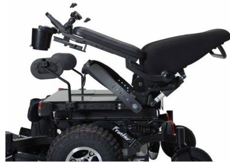
1337 - 135° Power Recline Multi Positioning Seating System (MPS)* 400 lbs. Capacity