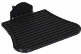
1347 - Center Mount w/1 pc fixed footplate 10" x 13", 10" height adj