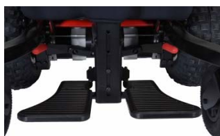
22578 - Standard 2 pc Footplate - 5"x10.5"