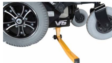
1595 - Power Wheelchair Tire Jack