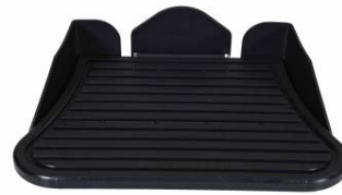
1548-1R - Heel Guard - 2" height fits 1347 or 1348