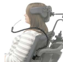
SNP - Sip and Puff - Controls the wheelchair by sipping and puffing