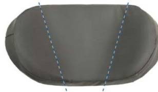
HD-MF - Comfort Company Moldable Headrest Pad - 10"wide x 6" heigh *Requires HD-BH