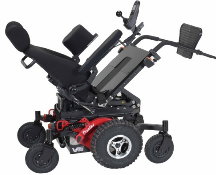
2851 - 50° Power Tilt In Space* 340 lbs. Capacity