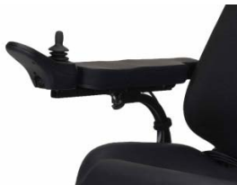
1490R - Standard Fixed - Depth Adj 8.25" Right Mount