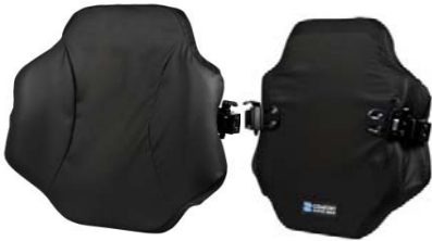
BK-R - Radius Back w/ High Resiliency Foam