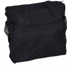
1604 - Deluxe Backpack - 13.5" x 15" x 4"