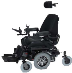
Mid Wheel Drive Hybrid