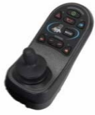
PG-JSM - Standard Rnet Joystick Module - No LCD Display or Mono Jacks