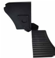
1355 - Center Mount w/2 pc flip-up footplate 10" x 13", 10" height adj