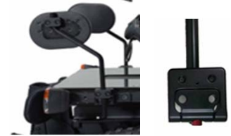
30094 - Flip Down Knee Adductors - set, multi-axis, flip down, with 4" x 6" Pad