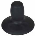
RJK - Cone-Shaped - Standard