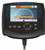
PG-OMNI - Omni Display - 4" Color Display for Alternative Drive Systems