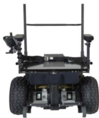
1367 - Standard Rehab Back Canes