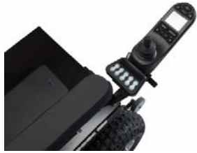
MSC5-P-S - External 5 Button Box -Placed Between the Armpad and the Joystick - controls modes through button box not through joystick