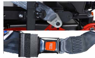
WC19V67 - WC 19 Transit Kit (V6) WC19X87 - WC 19 Transit Kit (X8)

Approved According to ANSI/RESNA WC 19 - Includes Lap Belt 600mm 2"x32"