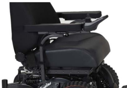
MPS - As small as 16" x 16" & as large as 22" x 20"