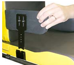
50596 - Removable Hip Guides - Set - Fixed Hardware, with 6" x 10" Pad