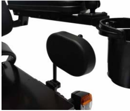
1509 - Removable Hip Guides - Set - Fixed Hardware, with 4" x 6" Pad