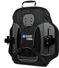
BK-M - ACTA Back w/ Moldable Center Section & High Resiliency Wings - M2 Cushion-Quadra Gel w/ Pelvic, Lateral & Medial Thigh Supports