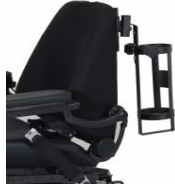
A02H - Articulating Oxygen Holder