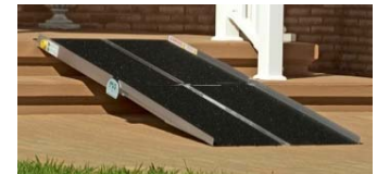
WCR630 - 6' Multifolding Ramp - Traction Tape