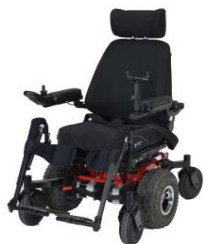
1886 - Side Mount Power Elevating - Swingaway - Independent or Combined - 2"height adj