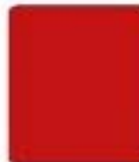
Fire Engine Red