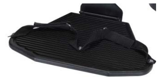
827A - Foot Straps - Pair - size