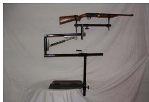
LM100 - BeAdaptive Limited Mobility Shooting Mount(for gun or crossbow)