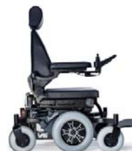
1574 - Pneumatic Grey Indoor Hybrid Tire 1573 - Solid Grey Indoor Hybrid Tire (Drive Tires Only)