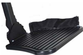
HL - Heel Loops - Pair Length 11.5" -