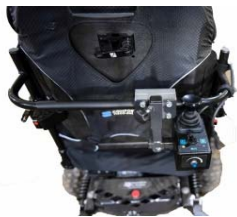
PG-AM - Attendant Control Joystick - Mounts to the back of chair or can be hand held