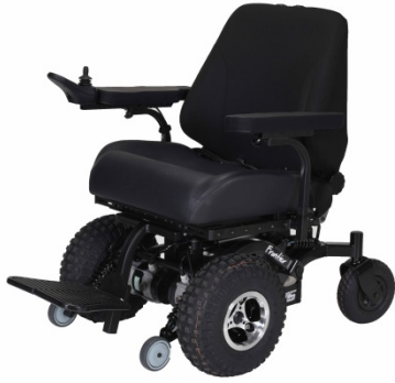
2799 - No Power Seat Frame with Seating System 400 lbs. Capacity