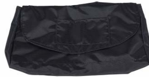
1603 - Medical Necessity Bag - Velcro's to Armrest 10.5" x 6" x 1.25"