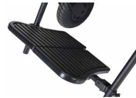
1371 - Side Mount w/leg cane w/2 pc flip-up footplate 8.5" x 6", 13" height adj