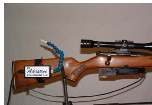
TM100 - BeAdaptive Trigger Mechanism