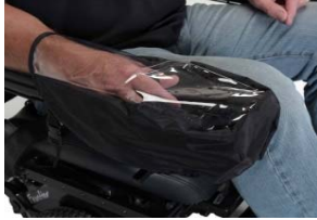
1606 - Waterproof Joystick Cover