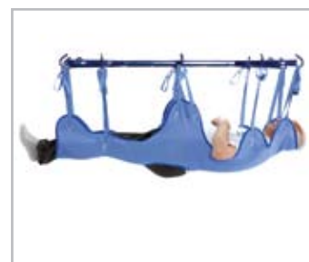
Stretcher sling with commode aperture