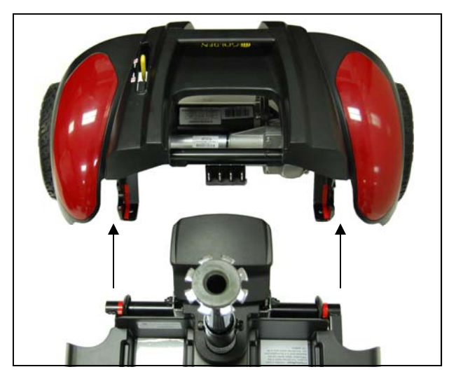
Figure 19. Drivetrain Alignment

3. Gently lower the battery pack onto the frame. See figure 21.