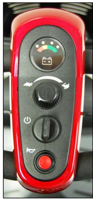
Figure 12. Key Switch (Off)