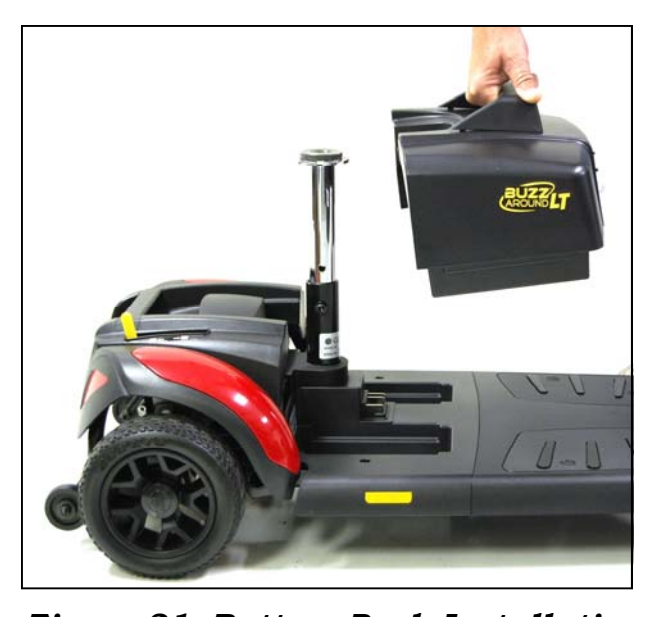
Figure 21. Battery Pack Installation