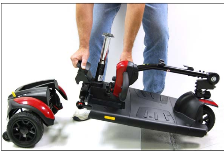
Figure 20. Connecting Frame and Drivetrain