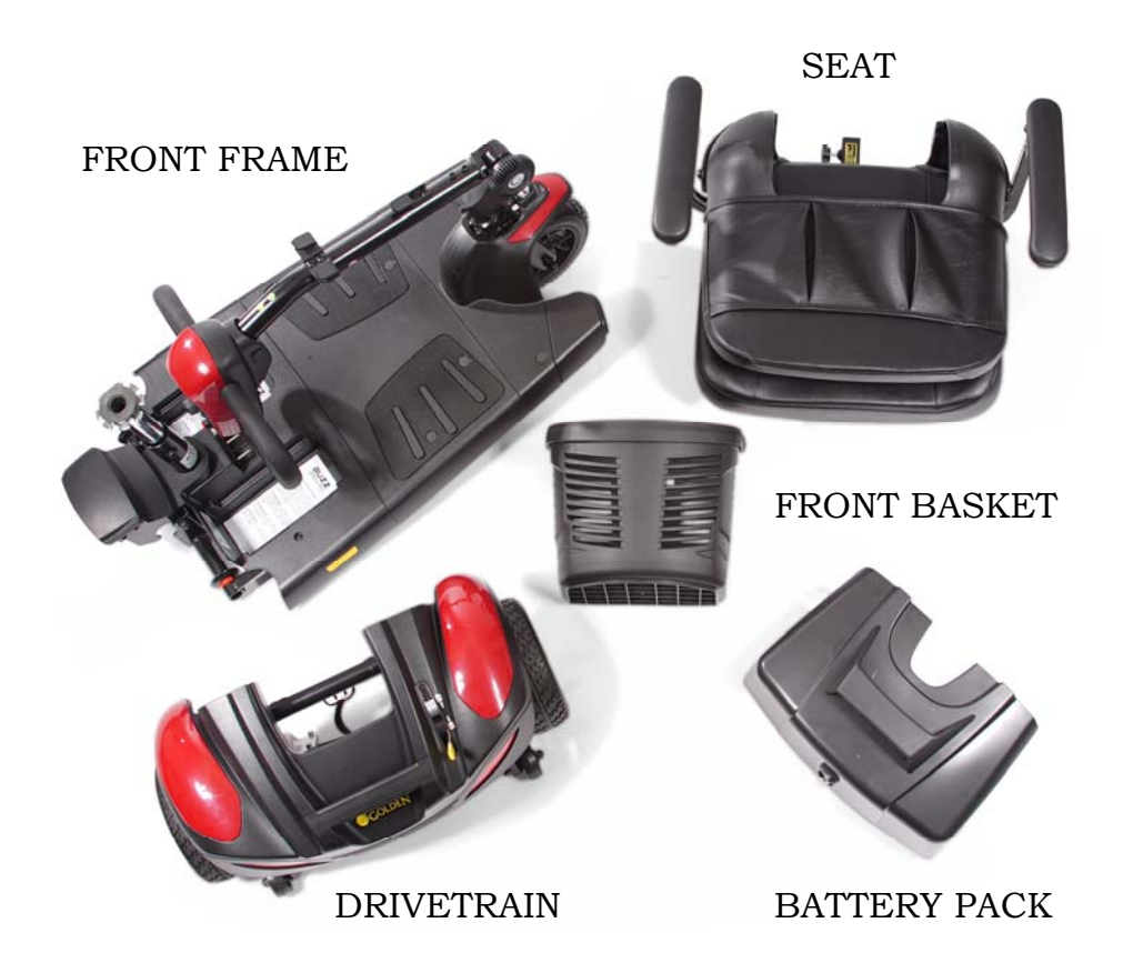
Figure 18. Buzzaround Lite™ Components (Model GB107)

Ensure that all components in the scooter have been correctly assembled. During assembly, please check that all connecting/locking devices are holding in place.