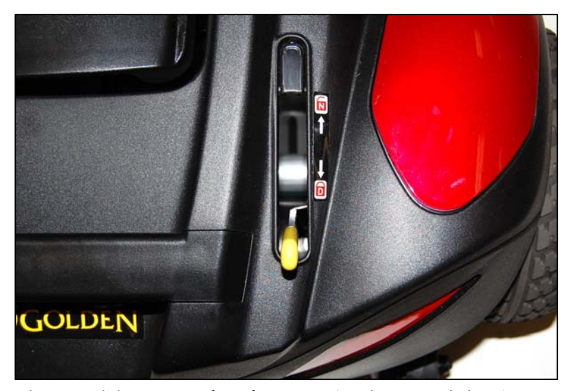
Figure 11: Freewheel Lever (Drive Position)

Your Buzzaround Lite™ is equipped with a freewheel lever that can set your scooter in or out of freewheel mode.