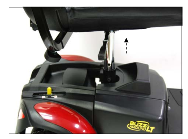
Figure 8: Seat Rotation Adjustment