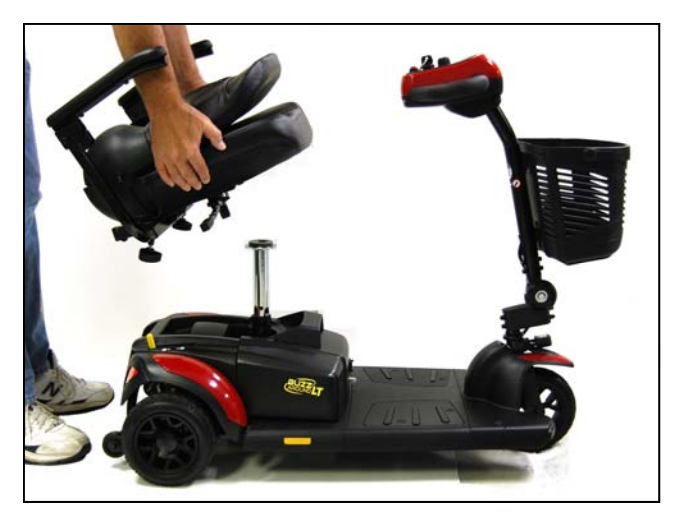
Figure 14. Removing the Seat

3. Grip the seat on opposite sides and, with a firm grip; pull the seat straight up. See figure 14.