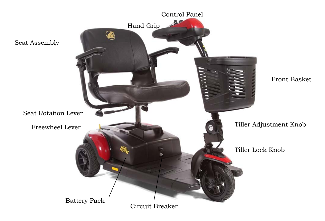
Figure 4. Your Golden Buzzaround Lite™ (Model GB107)