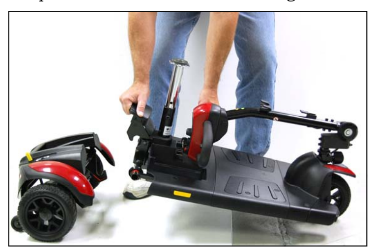
Figure 17. Separating the Drivetrain and Frame