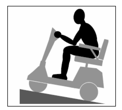
Figure 2. Going Up an Incline