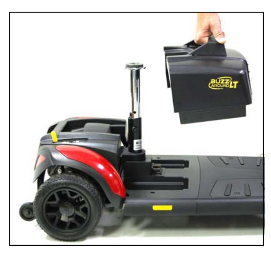
Figure 15. Removing the Battery Pack