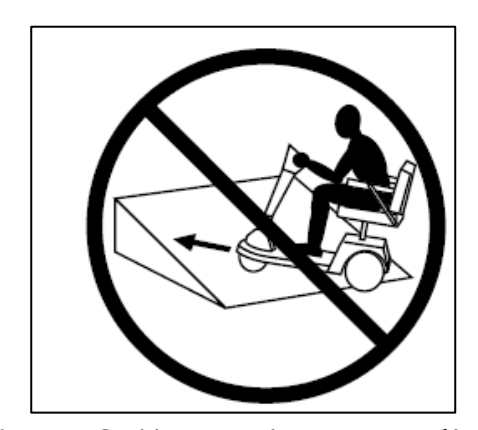
Figure 3. Traversing an Incline

WARNING If, while you are driving down a slope, your scooter starts to move faster than you feel is safe, release the throttle control lever and allow your Buzzaround Lite to come to a stop. When you feel that you again have control of your scooter, push the throttle control lever forward and continue safely down the remainder of the slope.