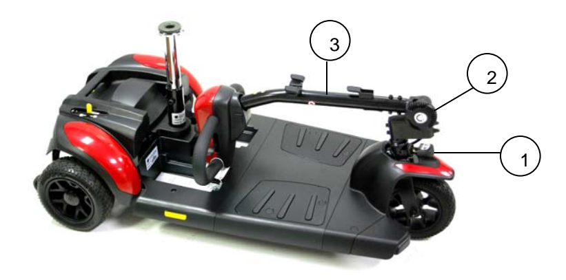
Figure 16. Lowered Tiller

6. Push in and turn the tiller lock clockwise 90 degrees. See #1 on figure 16. This will lock the front wheel to keep it from turning side to side to help control while carrying.