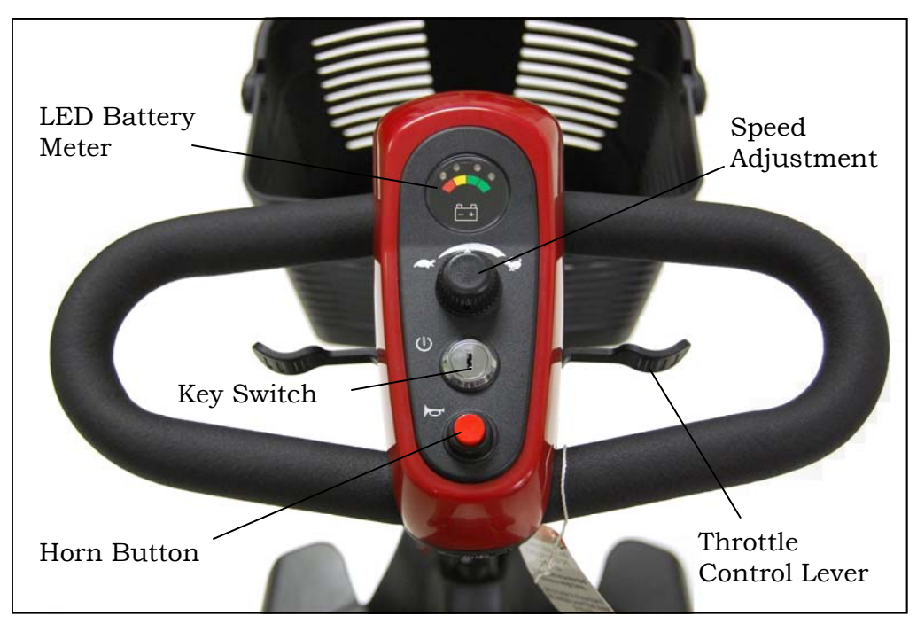
Figure 5. Buzzaround Lite<sup>TM</sup> Delta Tiller Control Panel