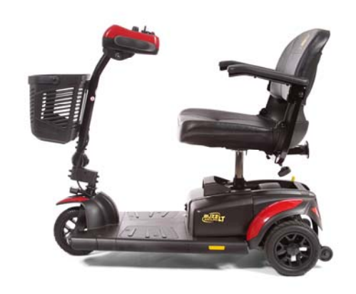
Figure 24. Buzzaround Lite™ (Model GB107)

All Golden Buzzaround Lite scooters can be equipped with docking devices for loading onto a vehicle by means of a mechanical lift or hoist. Contact your Golden Technologies, Inc. provider for more information concerning docking devices and scooter lift devices.