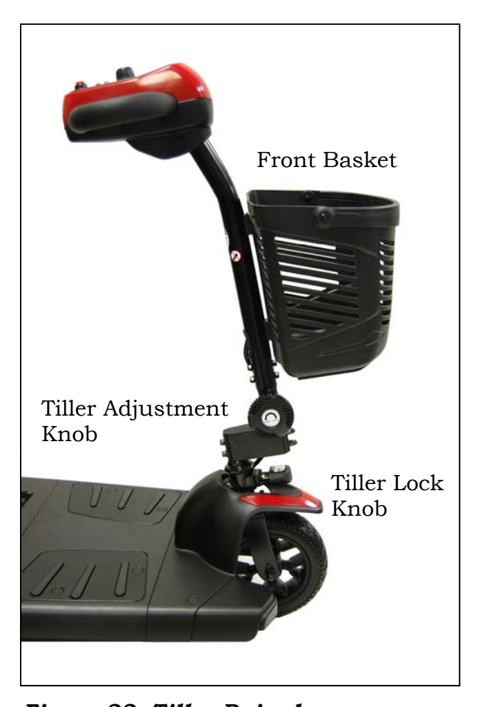
Figure 22. Tiller Raised

WARNING MAKE SURE YOU TIGHTEN YOUR TILLER ADJUSTMENT KNOB TO BE SURE IT IS SECURED IN THE DESIRED POSITION!