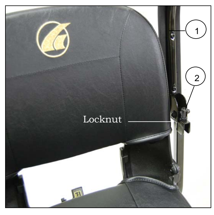
Figure 7. Armrest Angle Adjustment