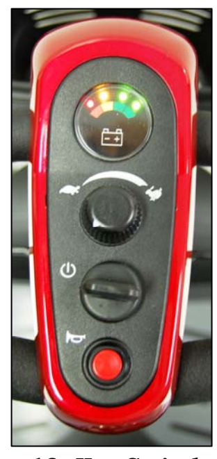
Figure 13. Key Switch (On)