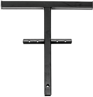
a- T Shaped Bracket