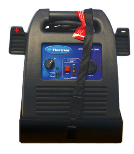
Optional Battery Pack AL205