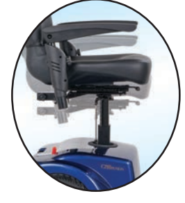
Power Elevating Seat*