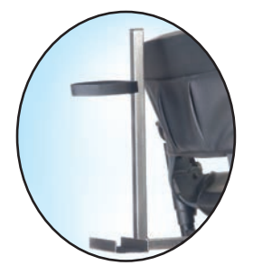
Quad Cane Holder