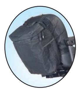
Deluxe Pack'n'Go (Fits seats 20" wide or larger and high back Captain's Seat.)