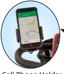
Cell Phone Holder