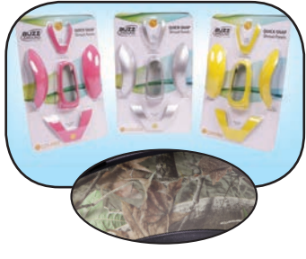
Optional BuzzAround Shroud Cover Colors: Pink, Silver, Yellow & Camouflage (Red & Blue come standard.