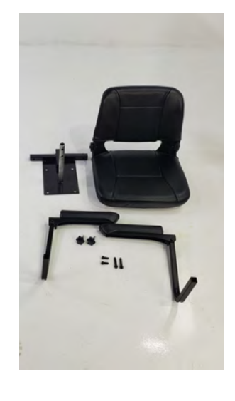
DELUXE - also includes all from standard.