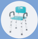
Premium Shower Chair