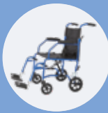
Aluminum Companion Chair

Designed In The USA and Distributed By: LIFESTYLE MOBILITY AIDS Email : contactus@lifestylemobilityaids.com Website : www.lifestylemobilityaids.com