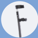
Commando Memory Forearm Crutch