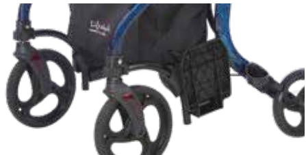
USED AS ROLLATOR