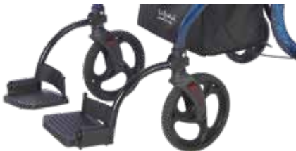
USED AS TRANSPORT CHAIR