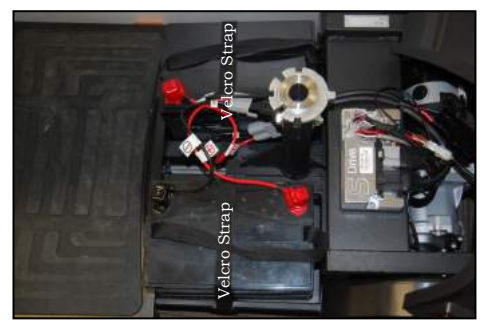
Figure 17. Battery Installation