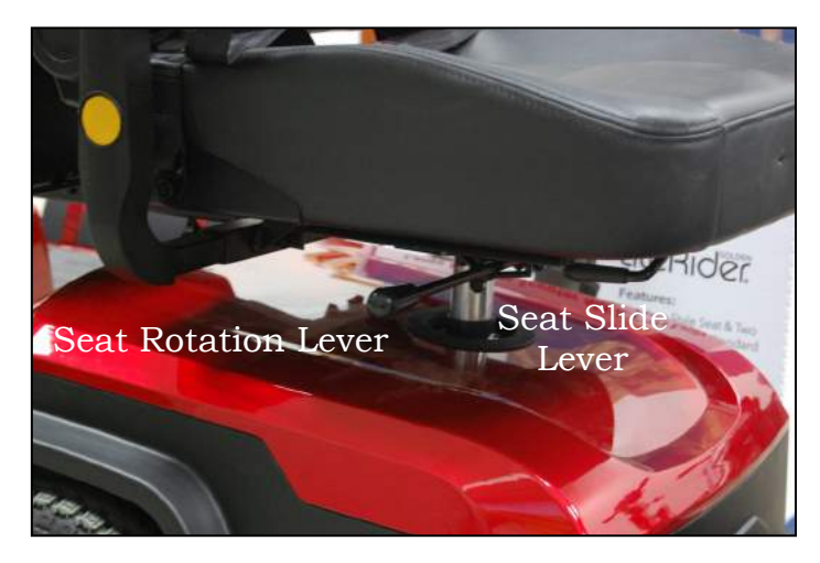
Figure 9: Seat Rotation Adjustment