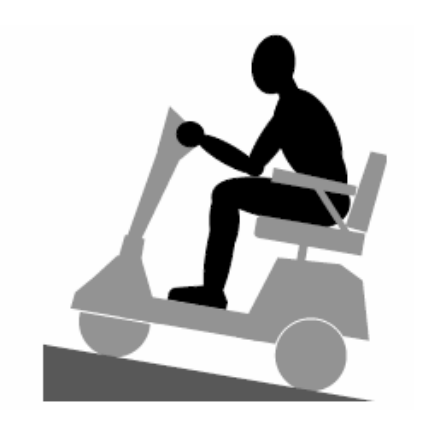
Figure 2. Going Up an Incline