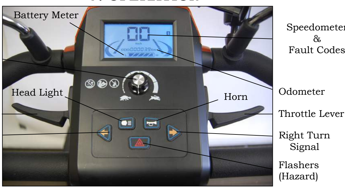
Figure 5. Delta Tiller Control Panel with LCD Display