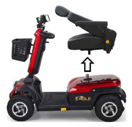
Figure 13. Removing the Seat

2. Fold the seat back down, grip the seat on opposite sides and, with a firm grip; pull the seat straight up and off of the seat pedestal. See figure 13.