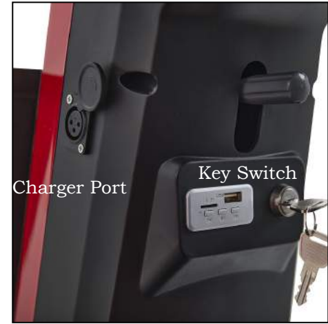
Figure 19. Battery Charging

When the batteries are fully charged, disconnect the charger power cord from the wall outlet and from the charging socket.