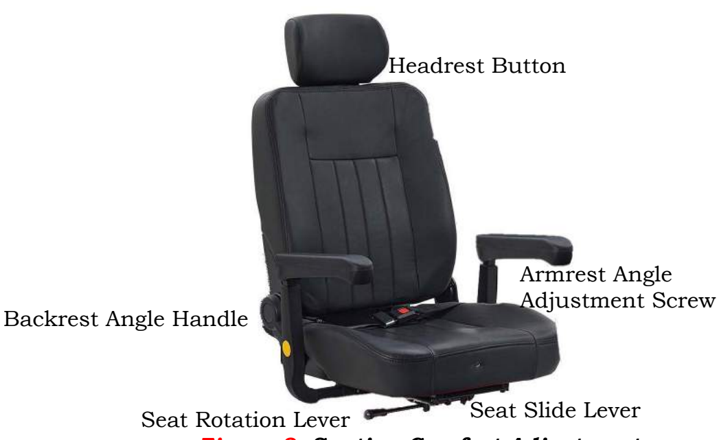
Figure 8. Seating Comfort Adjustments

Note: The lever is located on the right-side of the seat towards the front of the seat.