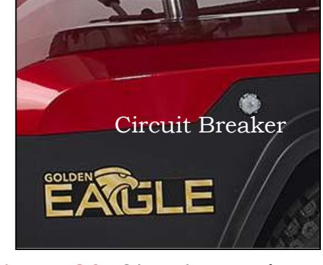
Figure 20. Circuit Breaker

As you operate your Golden Eagle, battery voltages go down and battery current must rise to satisfy the demands of the motor and of other electrical devices operating on your scooter. This can cause a heavy current draw that will trip the main circuit breaker.