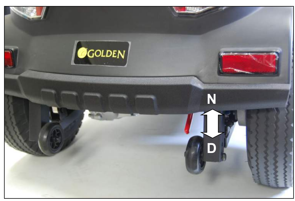
Figure 12: Freewheel Lever

Your Golden Eagle is equipped with a freewheel lever that can set your scooter in or out of freewheel mode.