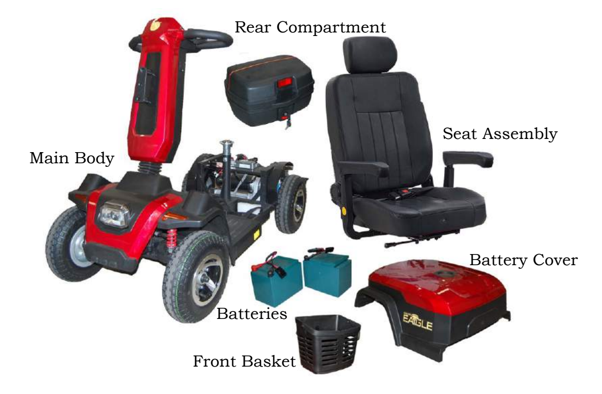
Figure 16. Golden Eagle Components (Model GR595)

Ensure that all components in the scooter have been correctly assembled. During assembly, please check that all connecting/locking devices are holding in place.