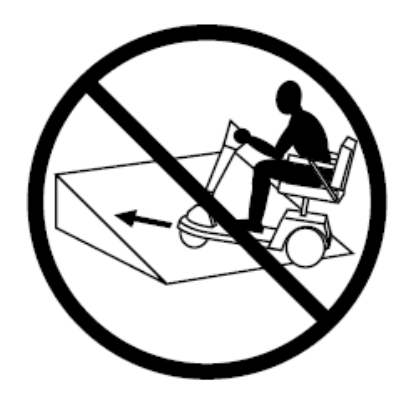
Figure 3. Traversing an Incline

WARNING If, while you are driving down a slope, your scooter starts to move faster than you feel is safe, release the throttle control lever and allow your Golden Eagle to come to a stop. When you feel that you again have control of your scooter, push the throttle control lever forward and continue safely down the remainder of the slope.