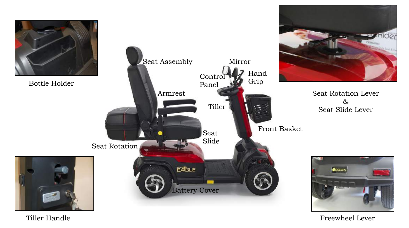
Figure 4. Your Golden Eagle (Model GR595)