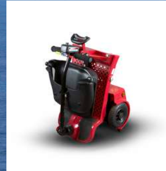
The Echo Folding easily folds down for storage or transportation.