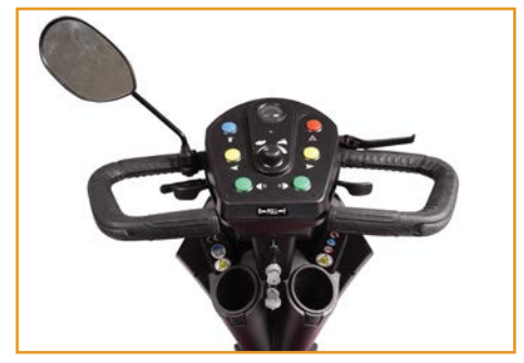
New button covers, hand (parking) brake lock, LED battery meter.