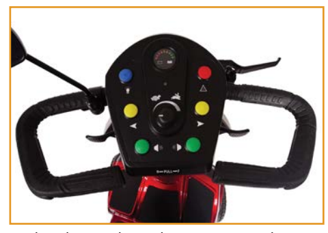
Updated control panel on wraparound delta tiller.