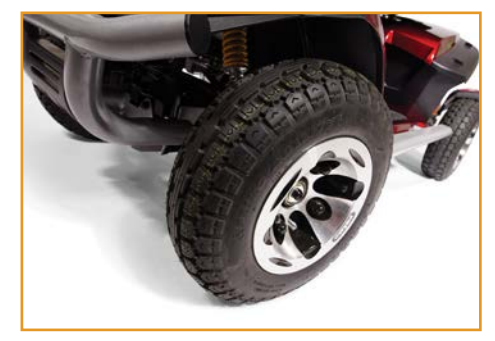
New 13" pneumatic tires.