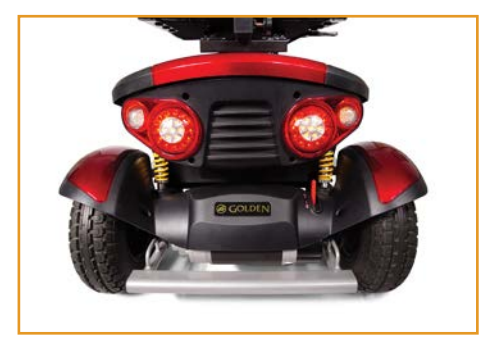
New ultrabright LED rear lights.