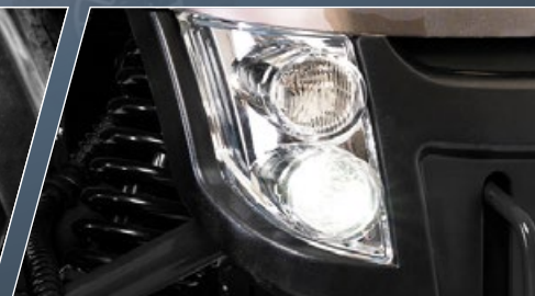
Full LED lighting package